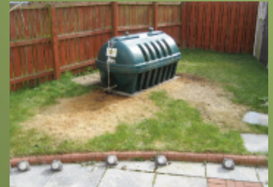
SITE PRIOR TO WORKS.