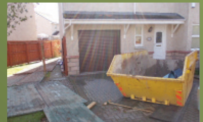
SITE PREPARATION INCLUDING PROTECTIVE BOARDS TO PROTECT ALL GROUND SURFACES.